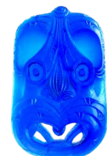
Uru ao - Glass

Displayed are games played and manufactured internationally from the Jack C Richards collection, including Chess, Jang Ji, and Mahjong. These games are exhibited alongside lesser-known games based around various modes of transport, such as surfing, horse riding, railways, and motoring, with touches of local flavour, from the Tairāwhiti Museum collection.