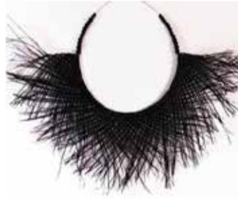
Poi-Circle of Life

The historical and cultural differences between the two countries have shown me the potential of art, as means to express individual identity in a respectful manner; and as a social bridge between people. A reminder not to lose what we have.