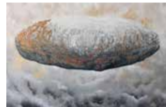
Rocking the Sky

So here is GEOLOGICA, an exploration and celebration of that very thing on which we live and depend.