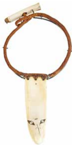
Rei-puta whale-tooth necklace. Great North Museum Hancock

The 37 taonga in Tū te Whaihanga include some of those which left on board the HMS Endeavour, after its first voyage to Aotearoa in October 1769. The taonga include eight painted hoe paddles, traded and gifted at sea off Whareongaonga (south of Tūranganui-a-Kiwa) on October 12, 1769, and te poupou o Hinematiore from her whare on Te Pourewa Island on October 28, 1769. Other taonga include rākau (weapons), kākahu (cloaks), tātua (belts), whakairo (carvings) and adornments.