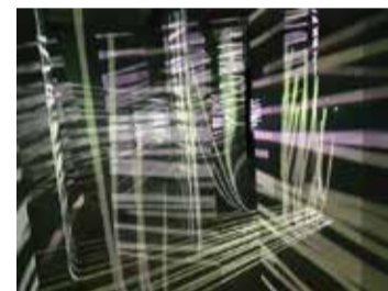
Construing Space, Immersive Installation, 2018

Her latest work is centred around phenomenological experience and seeks to challenge the visitor's perception of space, to ask what does looking feel like?