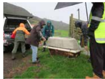
Retrieval of digging-implement, 2020

The exhibition is scheduled to open in our Concourse Gallery, late August 2024.