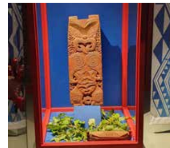
Te Pou o Hinematiore in the exhibition in Hohentübingen Castle.