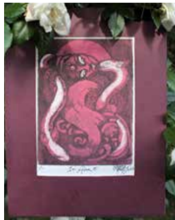
Iwi Atua - zinc plate etching

Some of the artists are connected through whakapapa and toi, some through art practices and specifically, printmaking. Similar themes across all thirteen artists resonate with whānau, taiao and kaitiakitanga.