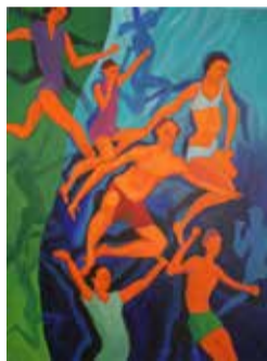
The Plunge - Jan Linklater

This exhibition is a celebration; please look and enjoy.