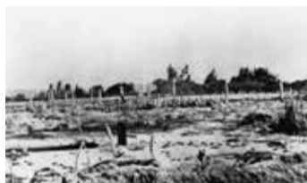
Waerenga-a-Hika pā in ruins after it was attacked in 1865.

Featuring a collection of taonga that connects to time and place of Tūranga in the 1800s, and contemporary artworks by selected Tairāwhiti practitioners, Hohou te Rongo , serves also as a bridge towards understanding and healing, through these shared visual conversations.